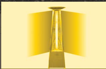
Falò Economical Performance Heater