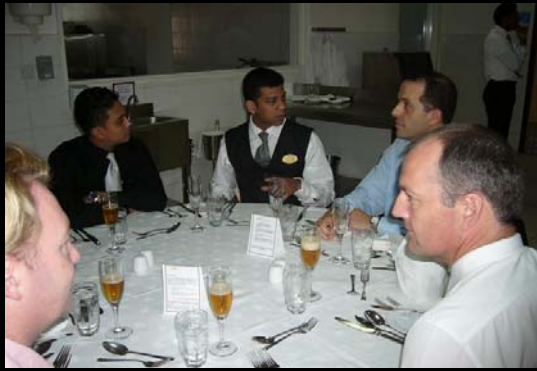
Chef's Table for Food & Beverage Managers at NHI