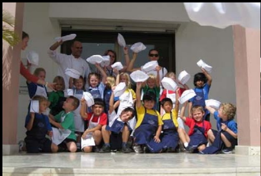
British School visit to Gulf Chef School at NHI