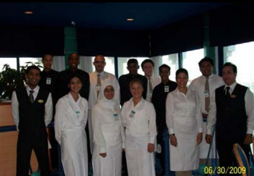
The Gourmet Night Service Team at Bandar Al Rowdha