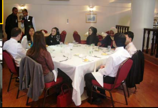
Chef's Table for Training Managers at NHI