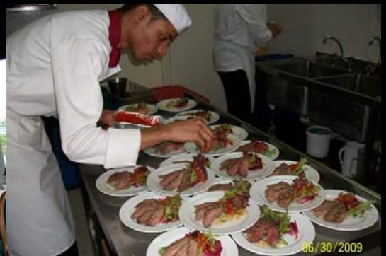
NHI trainee chefs preparing the main course at the Gourmet Night