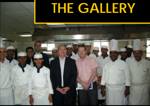
Food and Beverage Managers with Gulf Chef School chefs at NHI