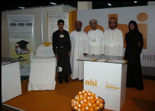
NHI at TRAINEX