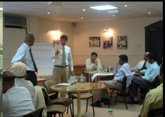
Al Hassan Meeting in Jebel Room conference facilities at NHI