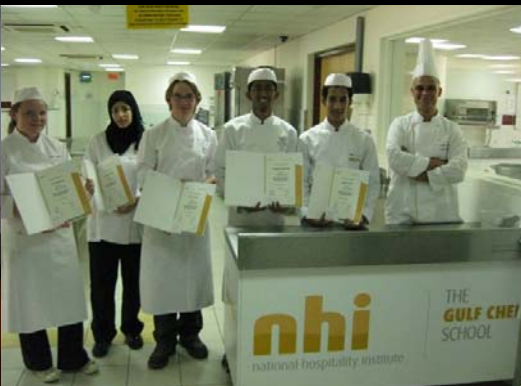
Teen Chefs at NHI