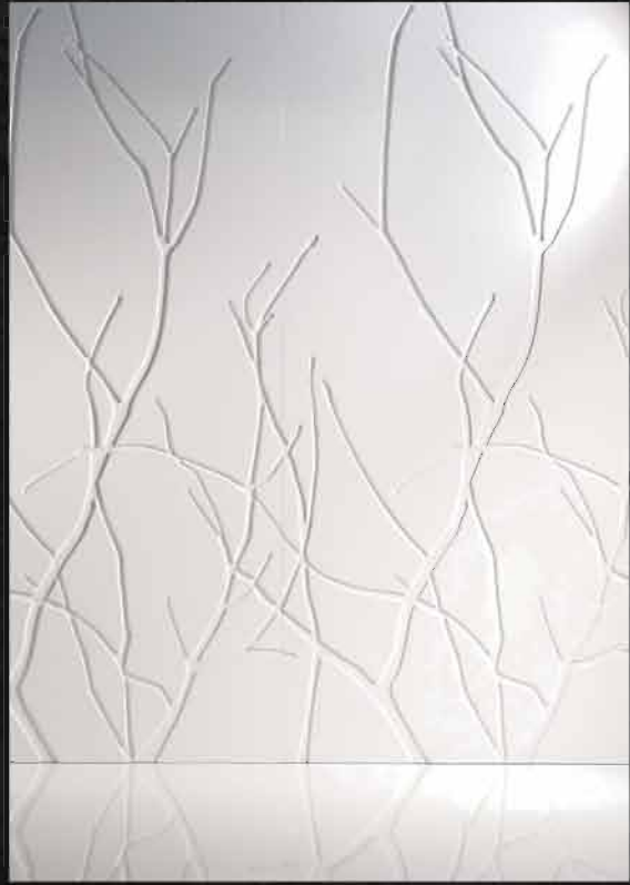
PATTERN WALL WITH WALL WASHER UP LIGHT