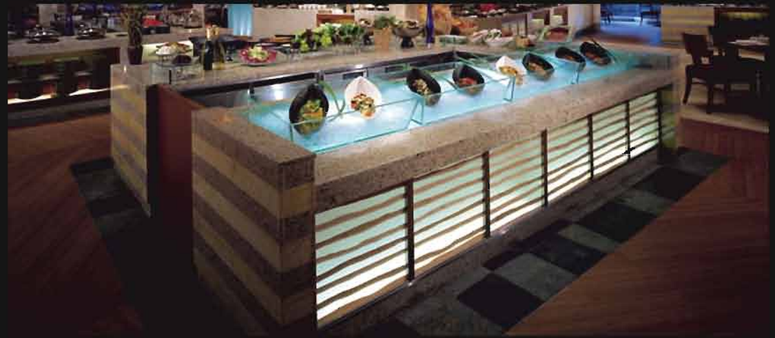
FRESH FOOD DISPLAY COUNTER