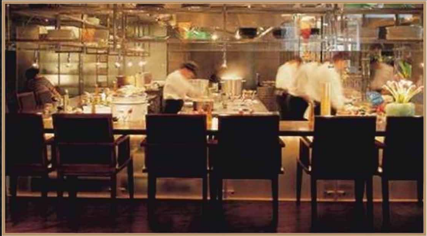
SHOW COOKING AREA