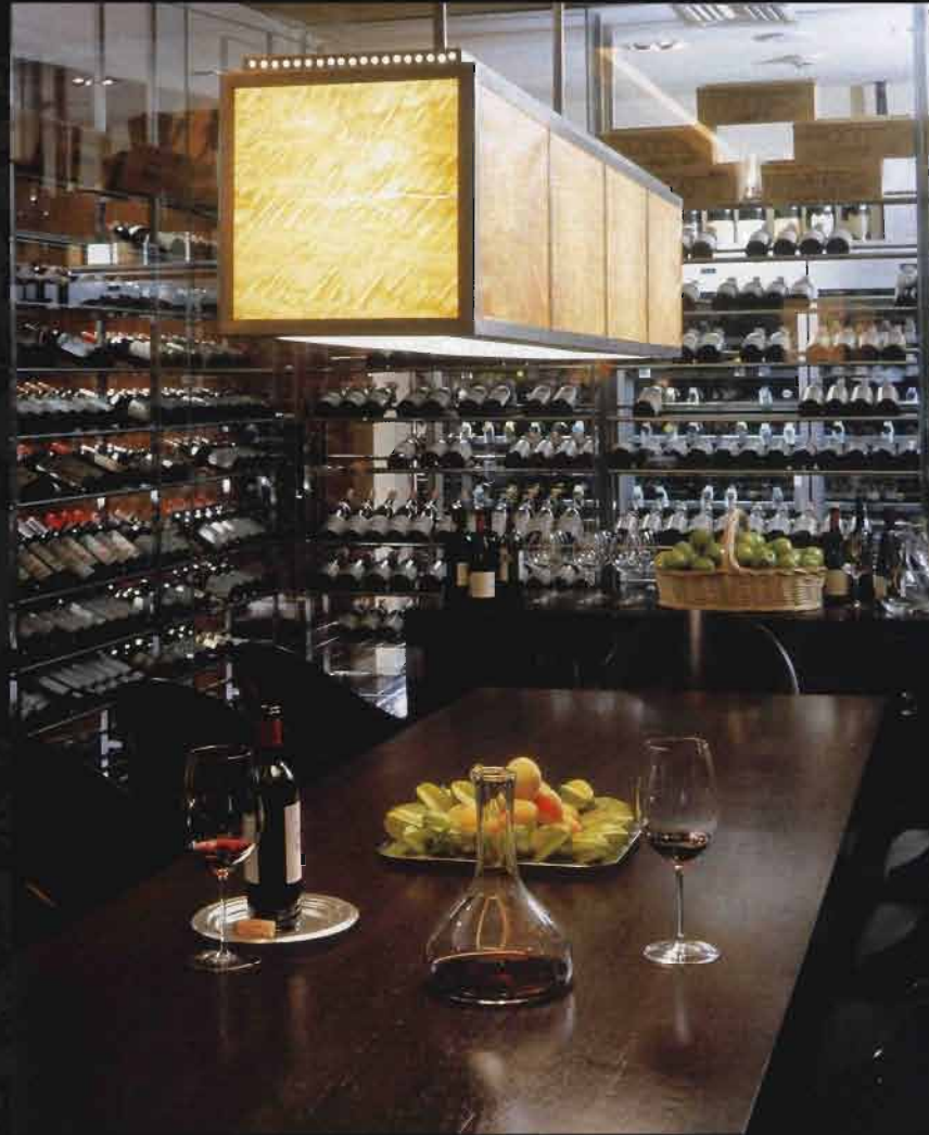
PRIVATE DINING WITH WIRE DISPLAY CABINET AS WALL DIVIDER.